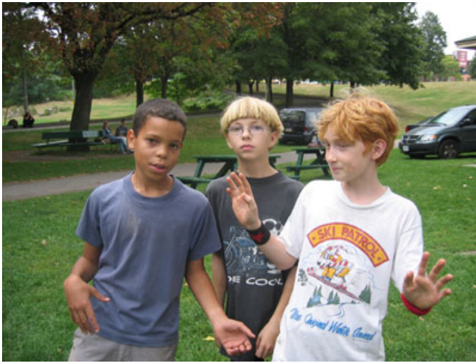
Dancing to the music and helping YAC celebrate