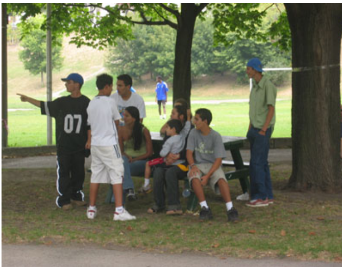
Some of the young people in the "Pits" who joined in