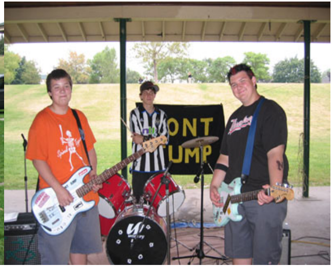
Benefit performers... Don't Jump